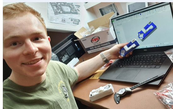
Summer internship with Ambessa Play, Oxford